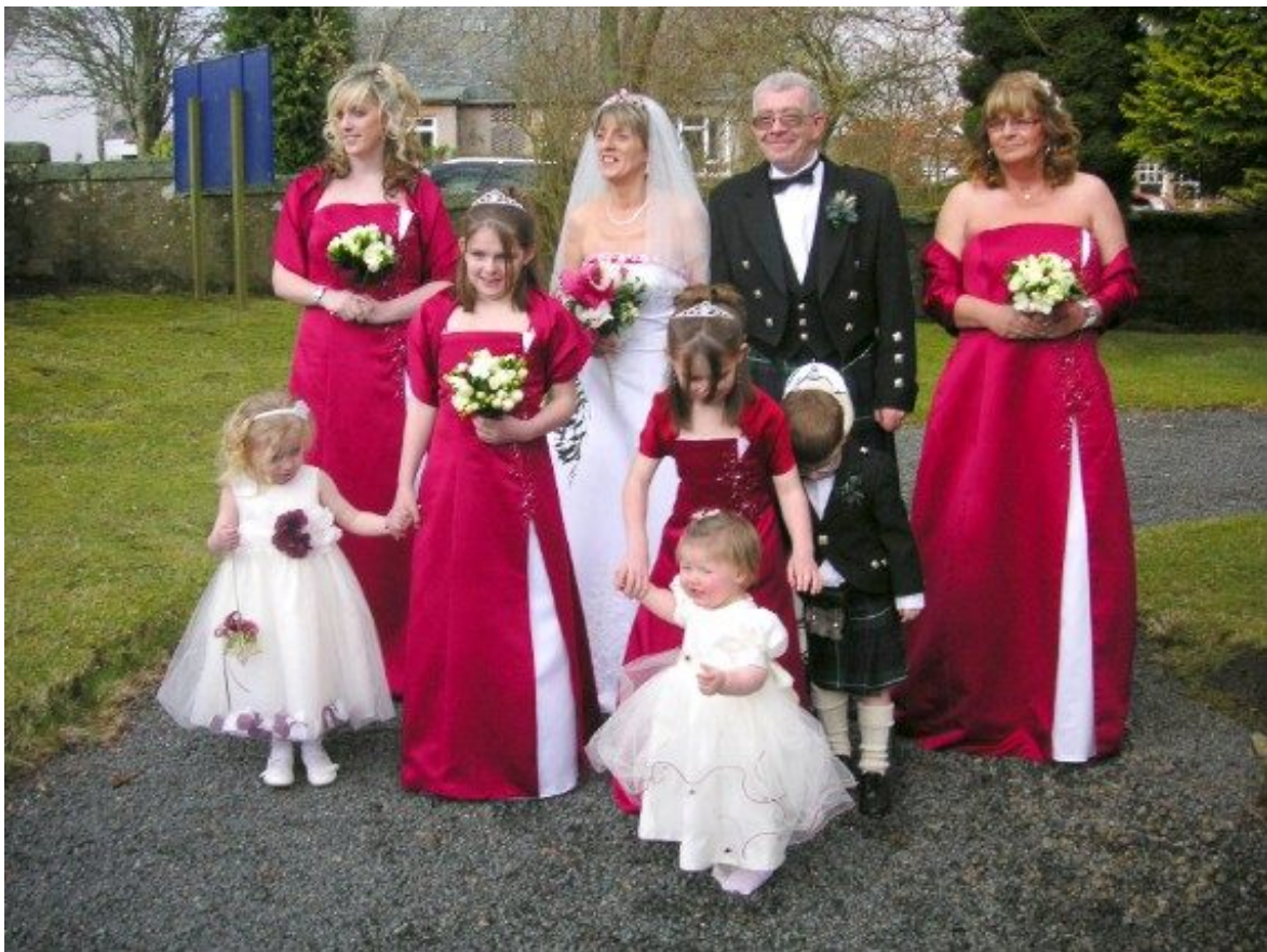
...and out into the sunshine (and showers)!