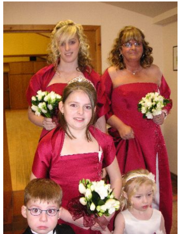
Ready to go!