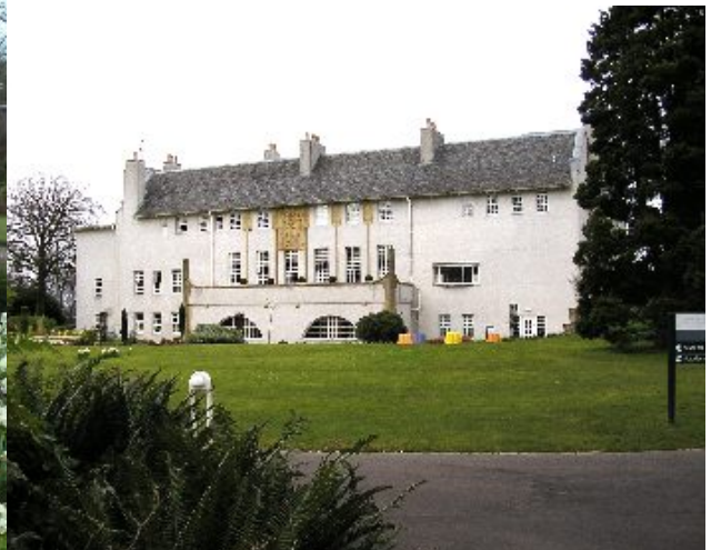
Reception at "The House of an Art Lover" - Bellahouston Park, Glasgow