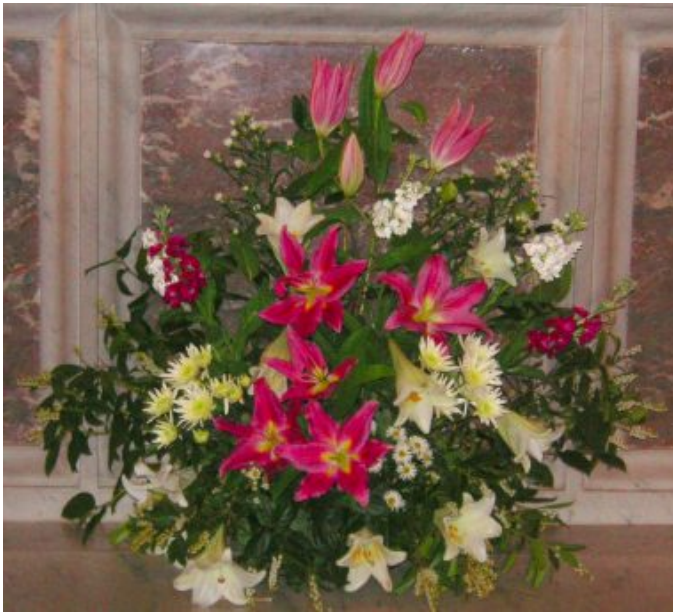
The flower-arrangers were in fine form!