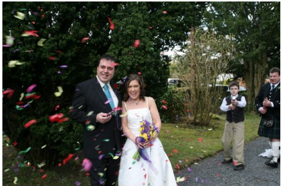
The confetti flies!