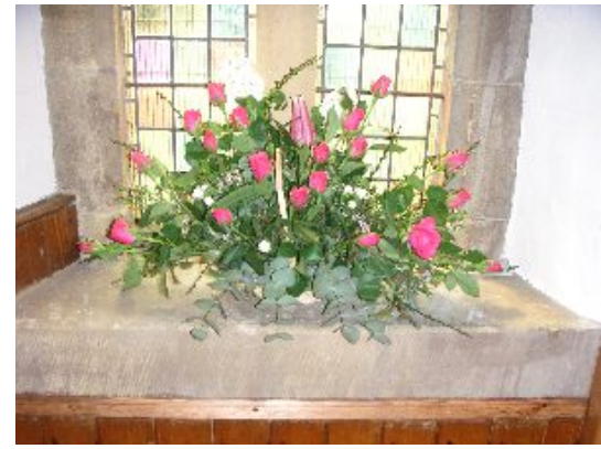
What a lot of super flower arrangements were made for all the weddings!