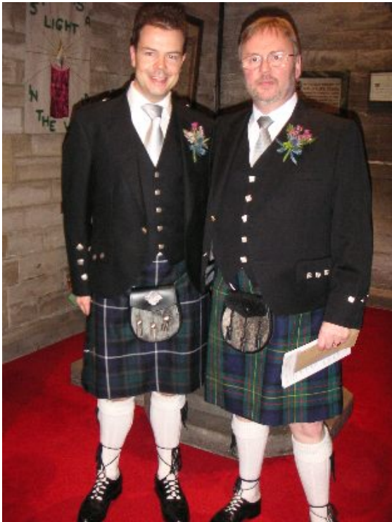
Chief Usher and Best Man - all in the family!