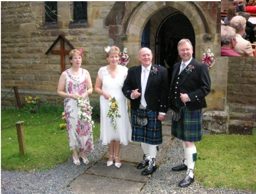
Enjoying the sunshine - weren't they lucky!