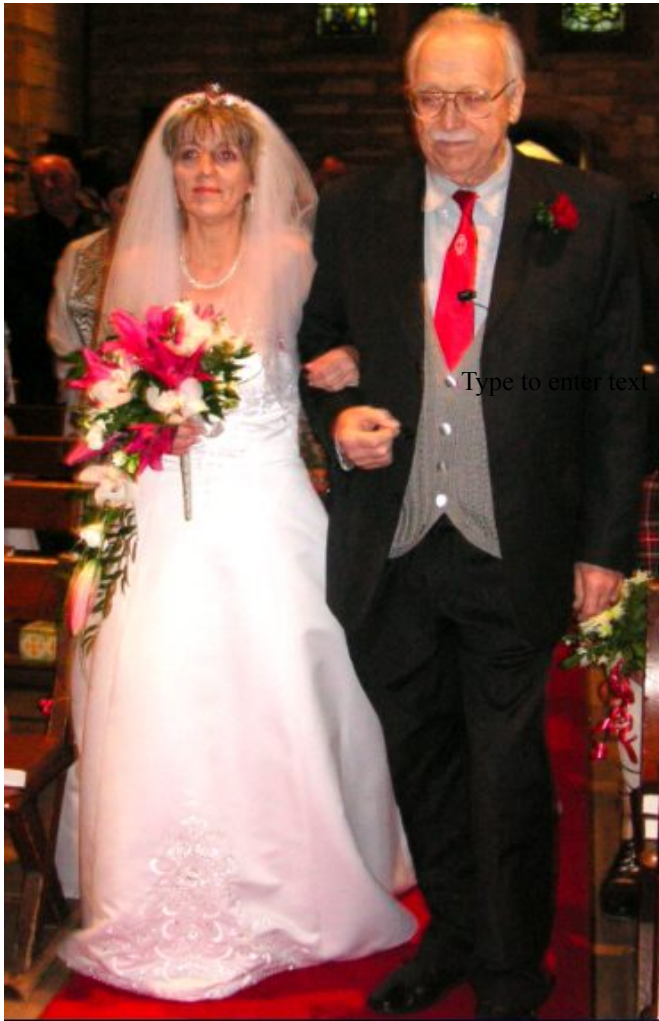
Up the aisle to the strains of "Crown Imperial"